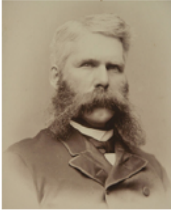
JSB, 1885 or 1890